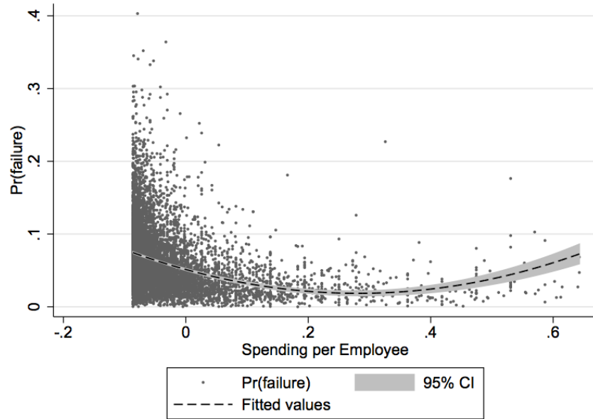
Figure 1: Predicted failure rate of firm (dots) and quadratic fit (dashed line). The shaded area is the 95% confidence interval around the fitted line.